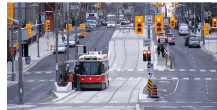
Dedicated-Lane Operations: St. Clair Avenue, Toronto